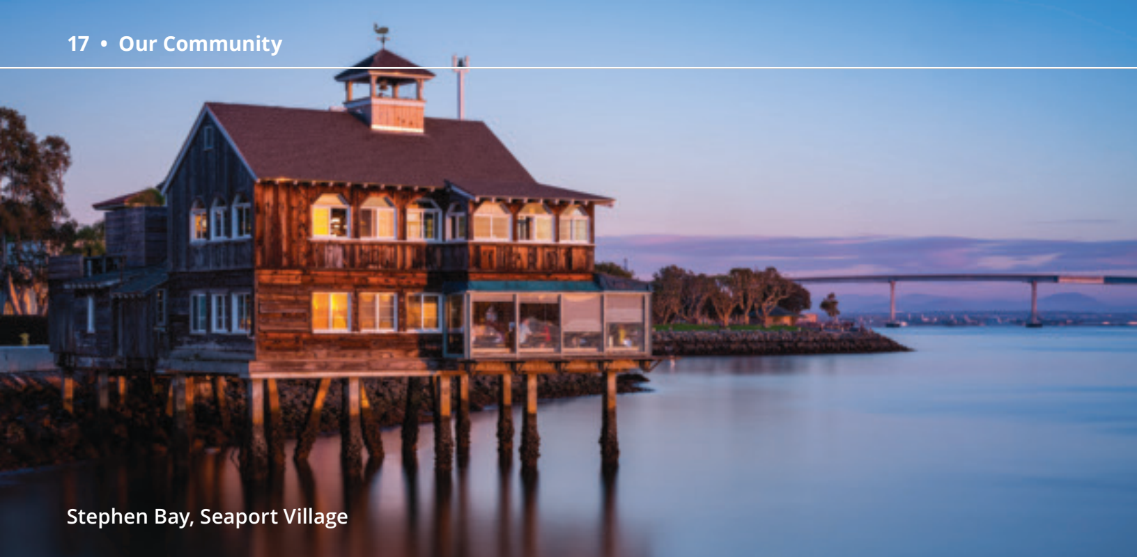
Stephen Bay, Seaport Village